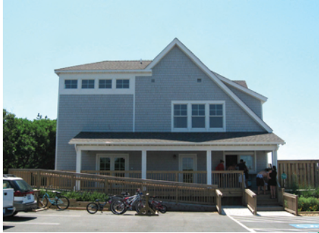
New Club House

Experience living in a preserved natural habitat, an Atlantic Ocean to Currituck Sound community. Nature trails and lakes are easily enjoyed and connect with Audubon Sanctuary. The racquet and swim club overlook the Currituck Sound. A pier and boat ramp make sailing, fishing, kayaking, and windsurfing quickly accessible. The Sanderling Resort & Spa, restaurants and amenities can be reached by a beach walk or bike to Duck's shops and eateries.