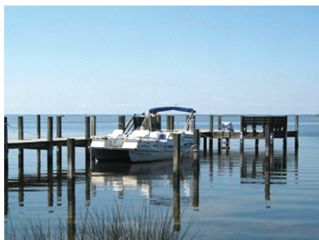
Pier and Boat Dock