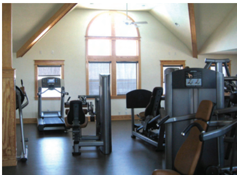
Nautilus & Fitness Equipment